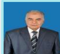
Hussein Azzaz Murad National Research Center, Egypt.